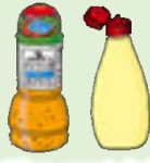
Bottles containing Mayonnaise or dressing