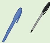
Ballpoint pens Magic markers