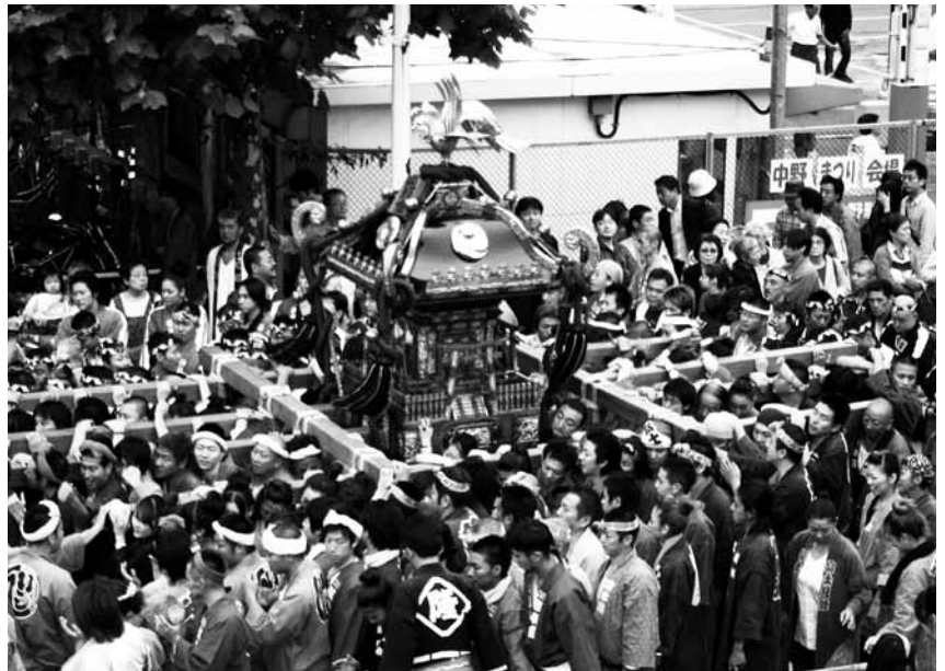
Scene from last year's festival

Inquiries: Nakano Festival Executive Committee Office within the Community Activities Support Desk (City Office 9F), Tel: 3228-5582 (in Japanese), Fax: 3228-5614