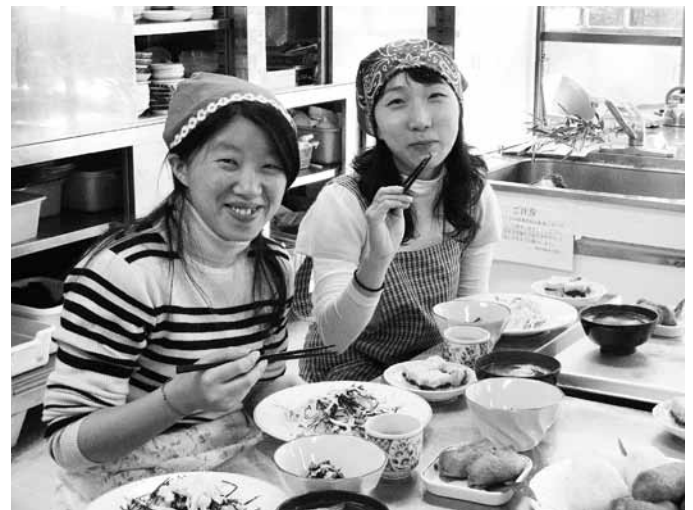
Make a dish and taste the results! (Photo of last year's class)